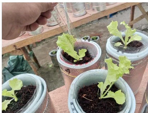
Figure 7. Representative lettuce plant growth in PET-bottle Kratky setup.

Note. Means with the same letter are comparable based on Tukey's HSD at the 5% level of significance.