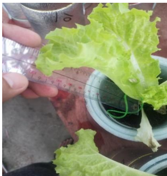
Figure 8. Representative leaf development under PET-bottle Kratky culture

Note. Means with the same letter are comparable based on Tukey's HSD at the 5% level of significance.