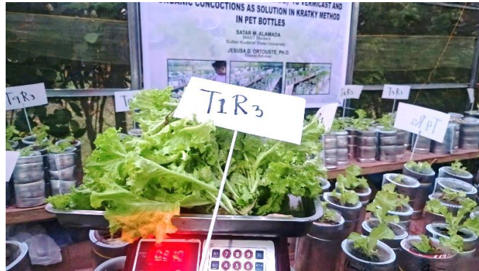
Figure 9. Fresh lettuce yield during harvest under commercial hydroponic treatment

The comparable marketable yield between T1 and T2 is important because it indicates that diluted vermicast can sustain lettuce growth and produce saleable biomass even without synthetic nutrient solution. However, the reduced productivity of combination treatments suggests possible nutrient antagonism, microbial immobilization, or chemical instability when fermented concoctions were mixed with vermicast. Such instability may affect pH, electrical conductivity, nutrient release, and root uptake in non-circulating systems (Solis & Jac, 2022; Park & Williams, 2024).