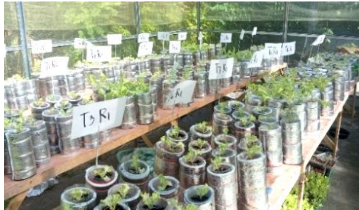
Figure 2. Representative PET-bottle Kratky setup used in the experiment.