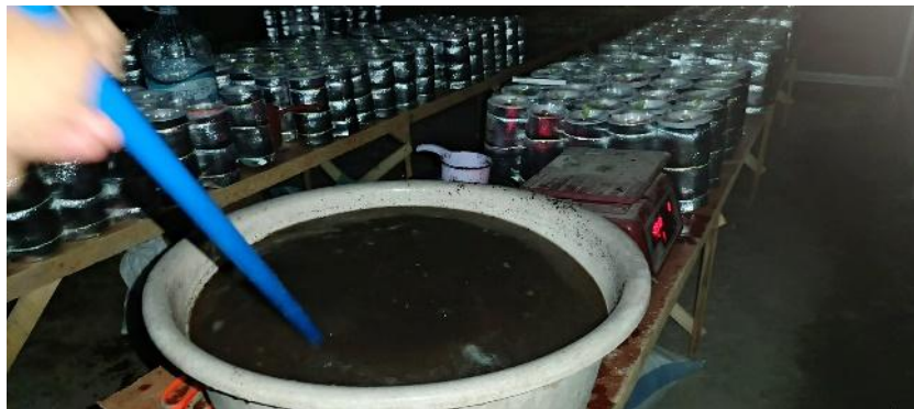
Figure 5. Preparation of combined organic nutrient solution

FPJ was prepared by fermenting chopped kangkong, camote tops, and kakawate leaves with molasses for seven days. FFJ was prepared by fermenting chopped papaya and banana with molasses for seven days. IMO was prepared by culturing microorganisms on cooked rice, mixing the colonized rice with molasses, and fermenting the mixture before extraction. Diluted vermicast was prepared by mixing vermicast with water at a 1:10 ratio. Commercial hydroponic solution was prepared according to the manufacturer's recommendation.