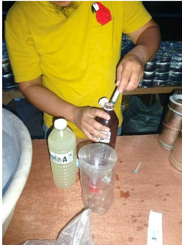
Figure 6. Application of commercial hydroponic solution to PET bottles