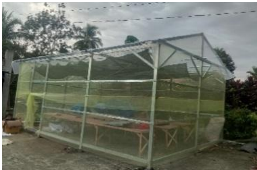
Figure 3. Actual greenhouse setup used to protect the lettuce plants.

The study used Lollo Bionda lettuce seeds, recycled 1.5-L PET bottles, coco peat, vermicast, Organikian hydroponic concentrated solution, pH-adjusting solution, seedling trays, measuring tools, and materials for the preparation of FPJ, FFJ, and IMO. Lettuce seeds were pre-germinated using the tissue-paper method and sown in seedling trays containing a 1:1 mixture of coco peat and vermicast. After 15 days, healthy seedlings were transplanted into prepared PET bottles containing coco peat and the assigned nutrient solution.