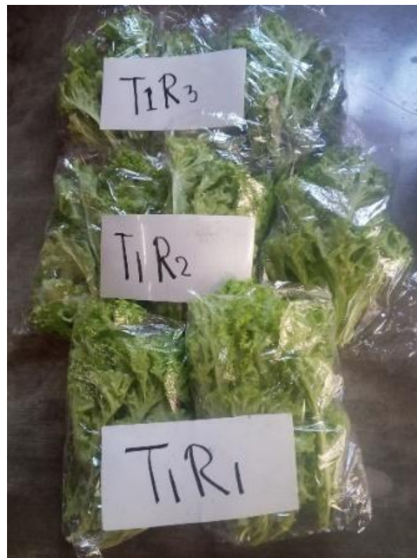
Figure 10. Representative harvested marketable lettuce samples.