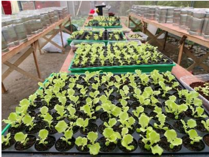
Figure 4. Lettuce seedlings prior to transplanting.