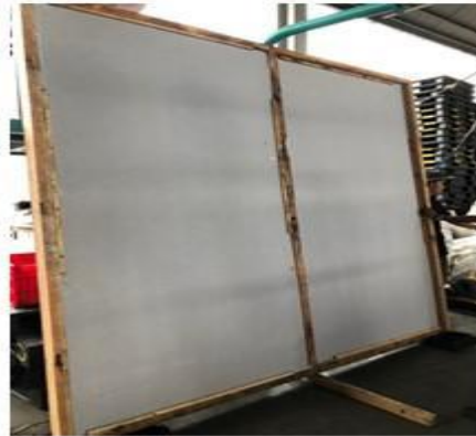
Figure 2. Barrier Design (Actual)

The construction of each partition will involve a combination of various materials and specialized noise blankets intended to maximize sound absorption. Despite these plans, the company has restricted production to a single prototype because of constraints regarding both time and funding. This barrier will serve as a test case to evaluate the effectiveness of different design features and material configurations before further implementation is considered.