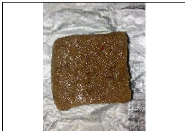
A. Initial product sample