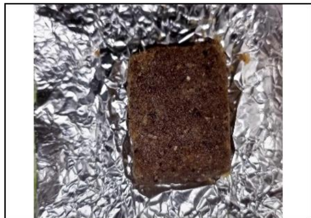
B. Stored seasoning cube