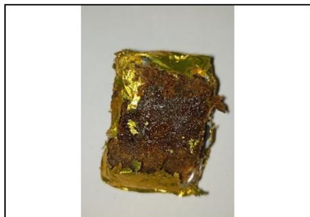
D. Advanced deterioration