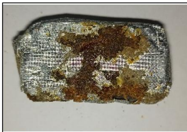
C. Visible deterioration